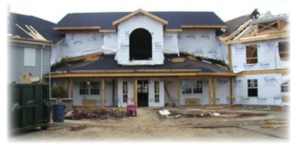
West Town Village, September 2004

Autumn Grove Residents Association Blessed Trinity Church Church of St. Jerome Church of St. Lawrence Church of the Assumption Church of the Good Shepard Church of the Transfiguration Gifts to the Poor Committee Henrietta Senior Center Boosters J.P. Morgan Chase Foundation Leroy United Methodist