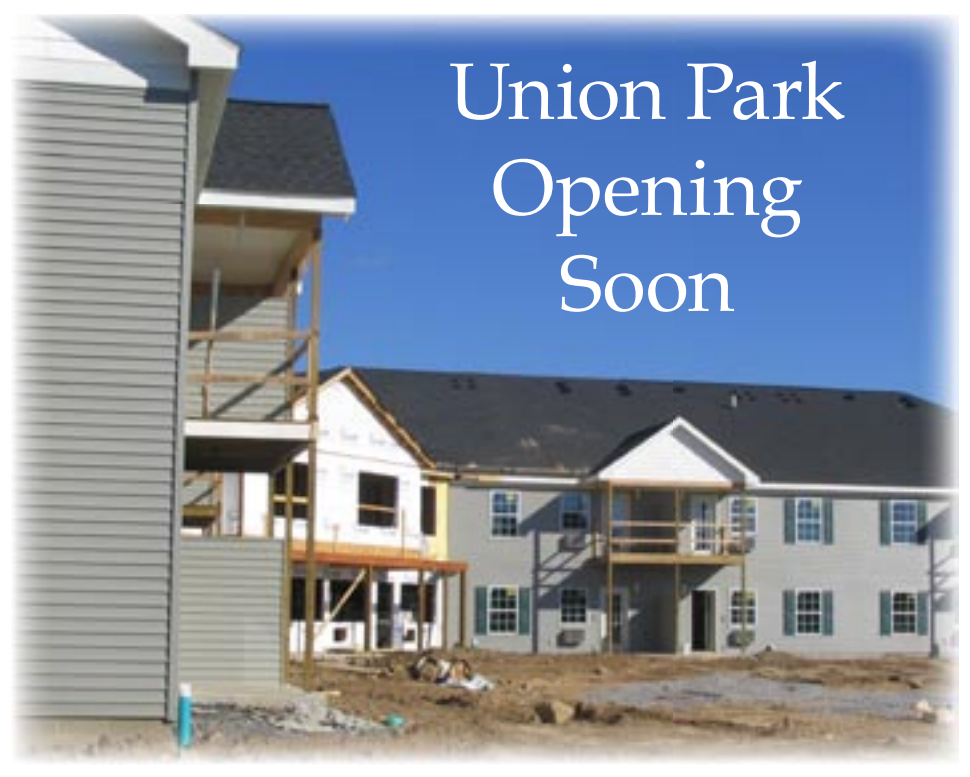
Union Park, North Chili

Funding for Union Park was made possible by the New York State Housing Trust Fund, the County of