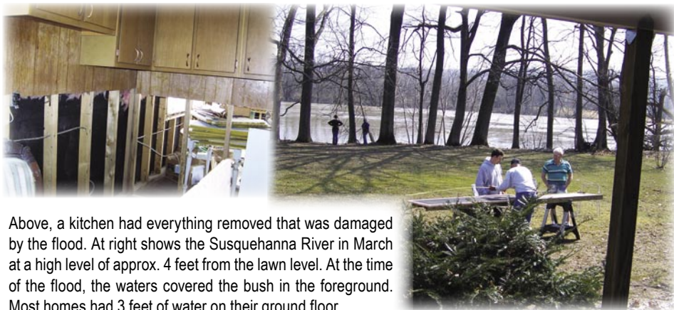
Above, a kitchen had everything removed that was damaged by the flood. At right shows the Susquehanna River in March at a high level of approx. 4 feet from the lawn level. At the time of the flood, the waters covered the bush in the foreground. Most homes had 3 feet of water on their ground floor.