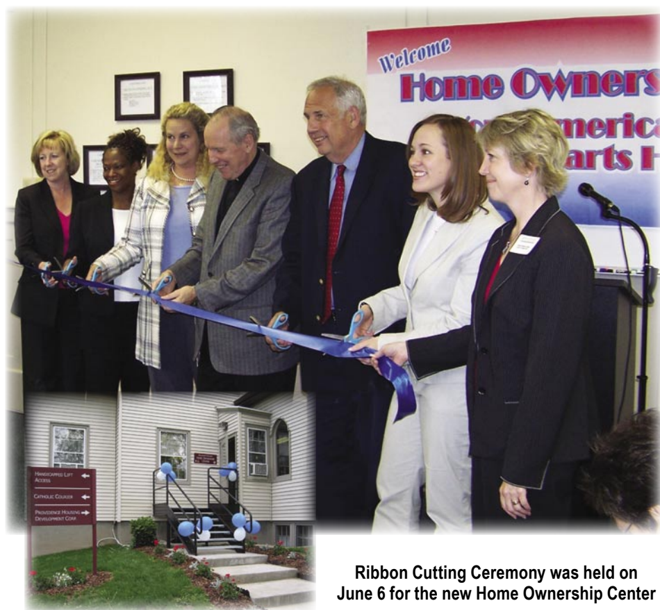
Ribbon Cutting Ceremony was held on June 6 for the new Home Ownership Center

An applicant may also qualify to participate in one of many matched savings programs to cover the required investment toward purchasing the home of their dreams. Income-eligible first-time buyers may also qualify for our Section 8 to Home Ownership plan. Credit Restoration assistance is also offered to