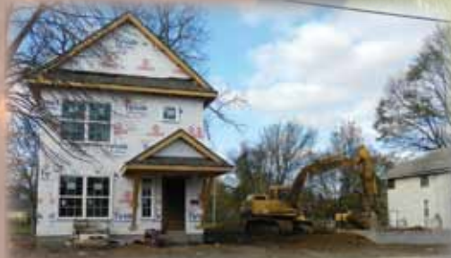
On left: One of the 25 single-family homes being built in the Edgerton neighborhood.