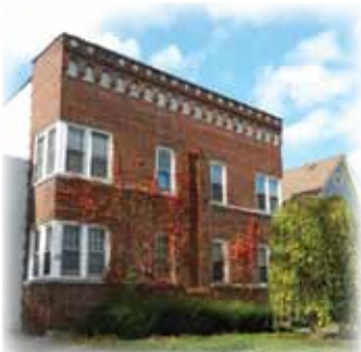
Rivendell Court Apartments is 19 units of permanent supportive housing in three buildings in the City of Rochester.

In February 2012, Federal Home Loan Bank of New York Affordable Housing Program, through member bank First Niagara Bank, N.A. granted a subsidy award in the amount of $300,000 to Providence Housing for Rivendell Court Apartments to complete much needed rehabilitation work.