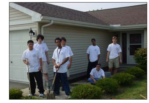
University of Rochester freshmen garden at Union Meadows on Wilson Day, the University's social service work day.