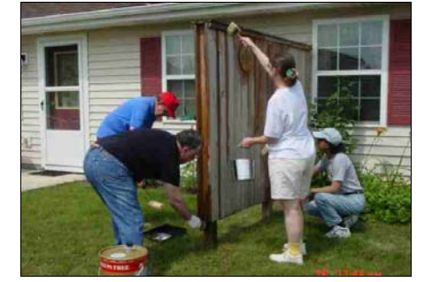
Volunteers from St. Margaret Mary Social Ministry spruce up the divider fences at Union Meadows this summer.